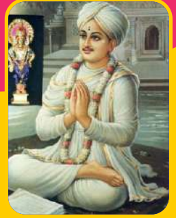
श्री संत एकनाथ महाराज पैठण